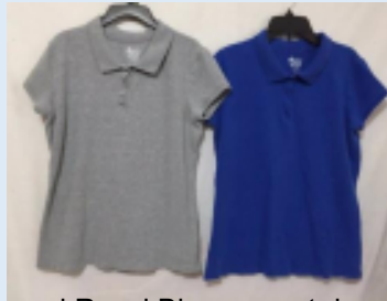
Gray and Royal Blue are not dress code colors