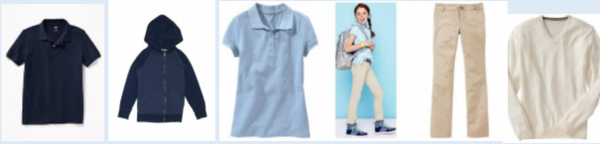
Clothing that DOES NOT meet dress code: